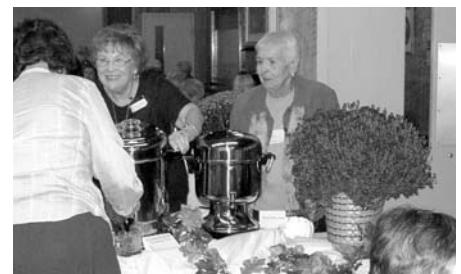
And gallons and gallons of tea!