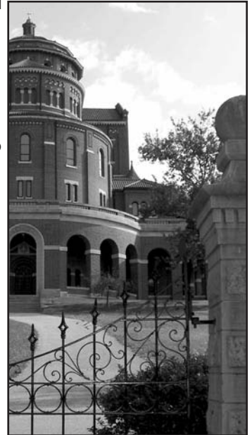
Church and Benedictine monastery in Ferdinand, IN

Three weeks later, the Our Lady of Fatima staff went to Ferdinand to participate in a staff retreat. The retreat center sits on the grounds of a Benedictine monastery, so I once again had the opportunity to pray the Liturgy of the Hours and attend daily mass, this time with the Benedictine Sisters of Ferdinand. At morning prayer on the first day, I listened as one of the sisters opened to Luke 12:35-40 and read Jesus' description of the watchful servant, the second of the two passages which seemed to be following me everywhere. My heart raced.